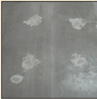
Bolt Hole Repair

Busy Beaver Inc. specializes in protection, repair and restoration of concrete floors. Below are the most common repairs services that we provide, however we are not limited to this list. If you do not see the concrete repair that you are interested in, please contact us. We will work with you to determine a plan of action that works within your time frame and budget.