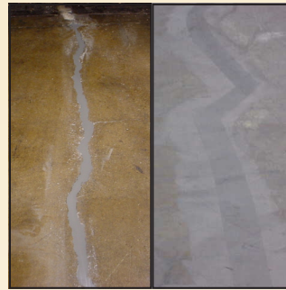
Crack Filling & Rebuilds