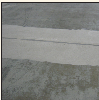
Slab Curl Removal