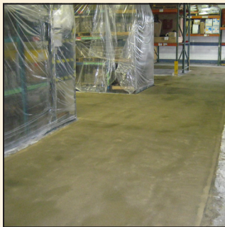
Epoxy Mortar Floors