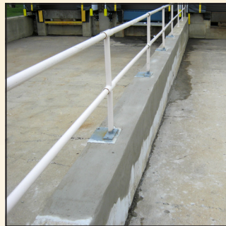
Exterior Concrete Repair