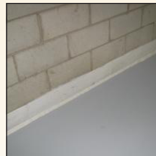
Urethane Perimeter Concrete

Busy Beaver Inc. is the Midwest's leading flooring contractor for concrete protection, repair and restoration. Founded over 40 years ago, our company is at the forefront of improving and protecting the commercial, institutional and industrial facilities of our clients. Each year, Busy Beaver Inc. services millions of square feet using only top quality products and industry trained field technicians. Experienced project management teams partner with our client's beginning with job estimating through job completion. Our team approach builds relationships that result in total client satisfaction.